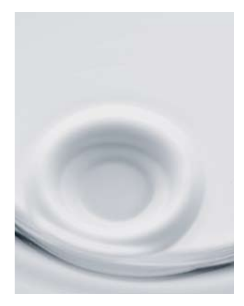
EKamold<sup>®</sup> suspensions are used as lubricants, for example for light-metal casting.