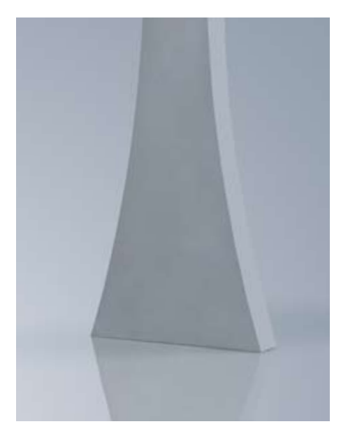
\ensuremath{\mathsf{MYCROSINT}}^{\circ} side dams for thin-strip casting of steel and nonferrous alloys