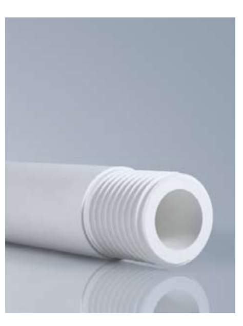
MYCROSINT® casting nozzles for molten metals