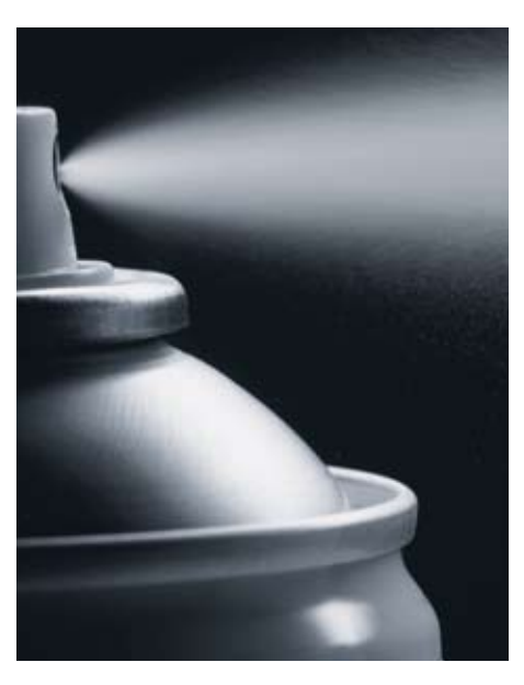
EKamold® aerosols are ideal release agents and lubricants for coating small surfaces.