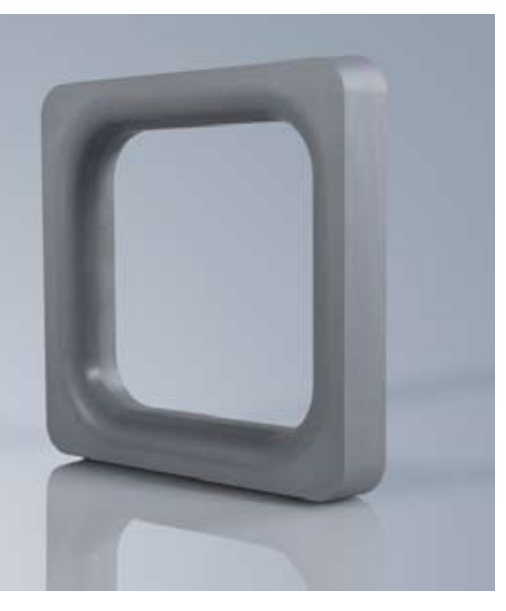
MYCROSINT® break rings for horizontal continuous casting of steel and nonferrous alloys